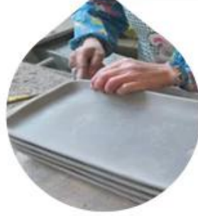
8、 Glazed Firing