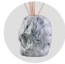
Water Transfer Printing

Welcome to our video channel as following links to watch Sunny Company introduction and products presentation https://www.youtube.com/channel/UCcnnb_BDNnGW-w2W6AZmoJg https://youtu.be/esREMsXEgrw