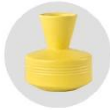
Solid color glaze