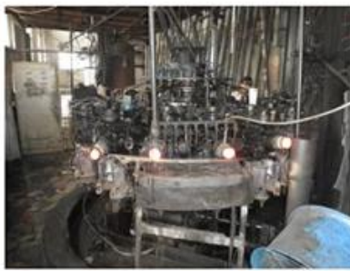
□ Machine Blown