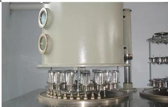
04 VACUUM ELECTROPLATING