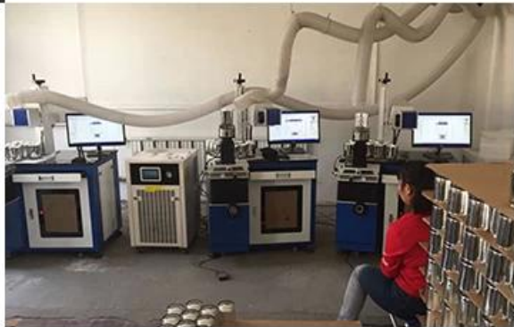
02 LASER ENGRAVING