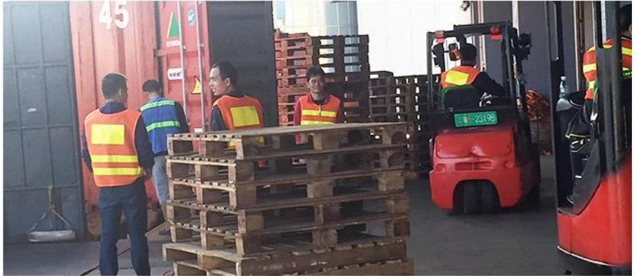
Own professional shipping company( Shenzhen Sunny Worldwide logistics)