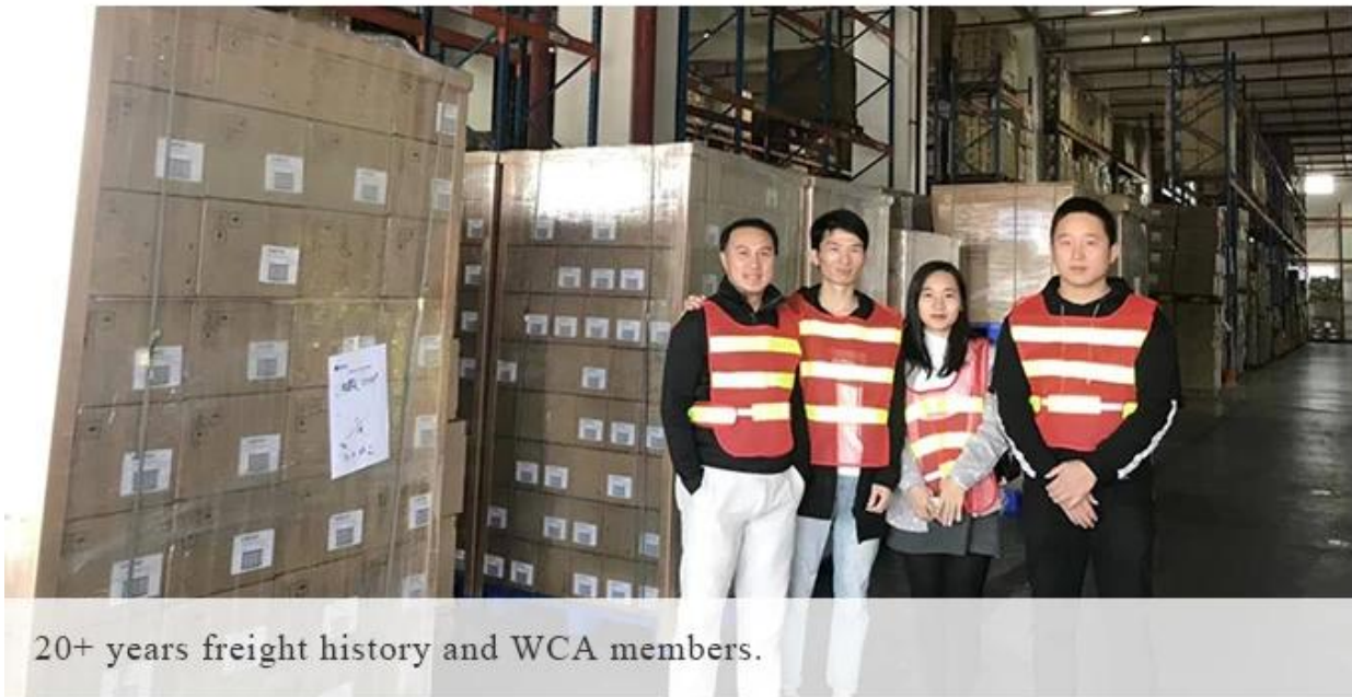
20+ years freight history and WCA members.