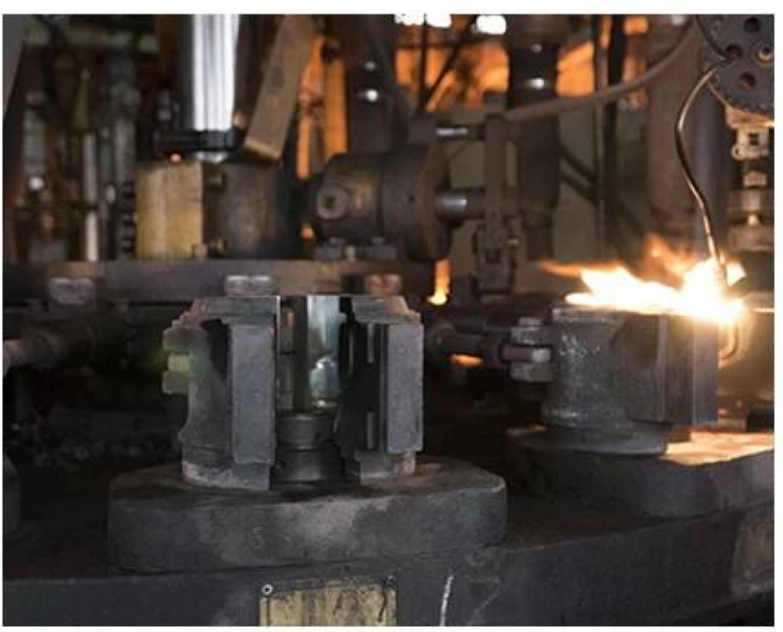
There are about 20000 square meters in our factory which was built in 1992 year;