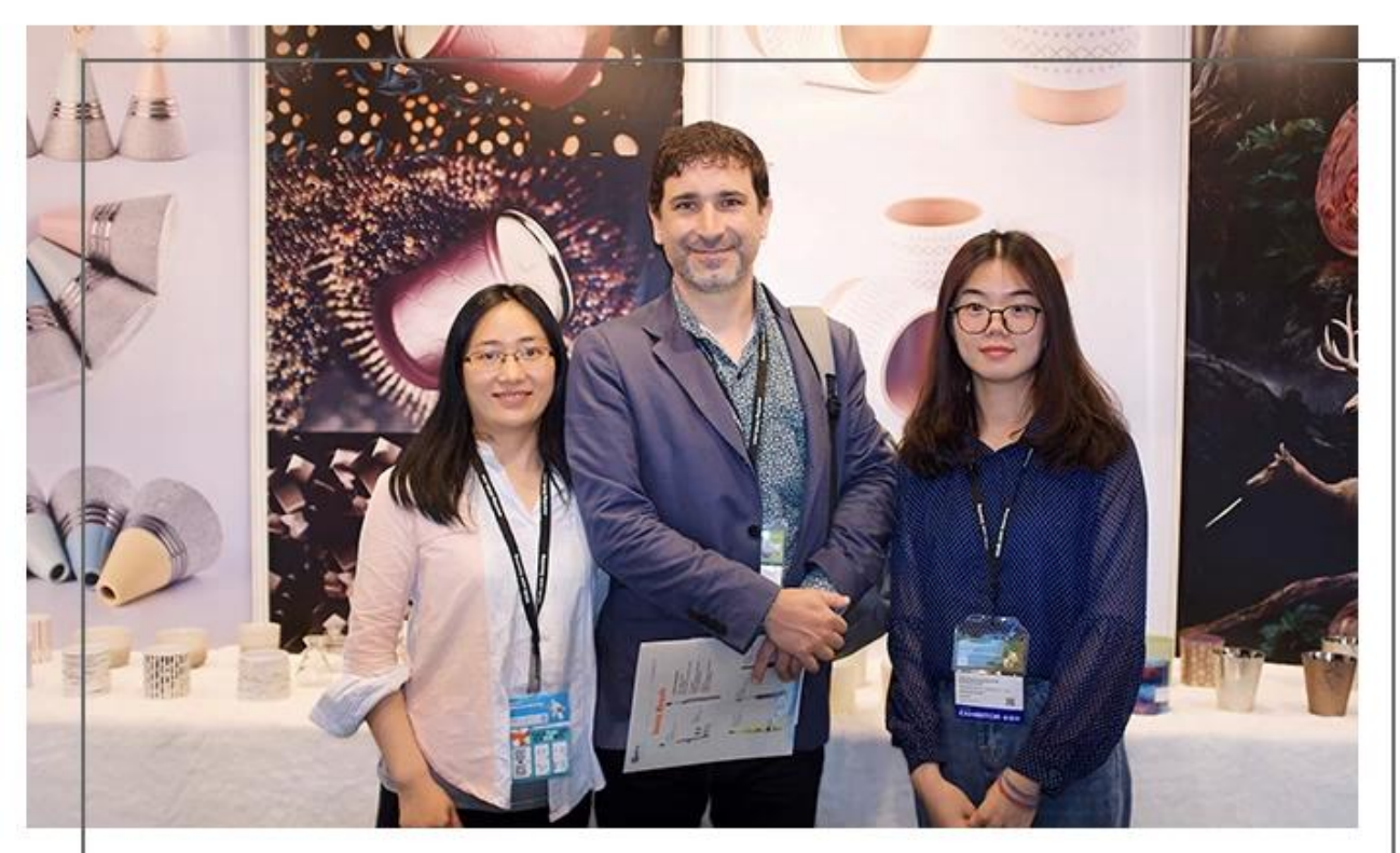
We have taken part in various exhibitions since 2002 year, like Shanghai, London, Las Vegas, Hongkong show.