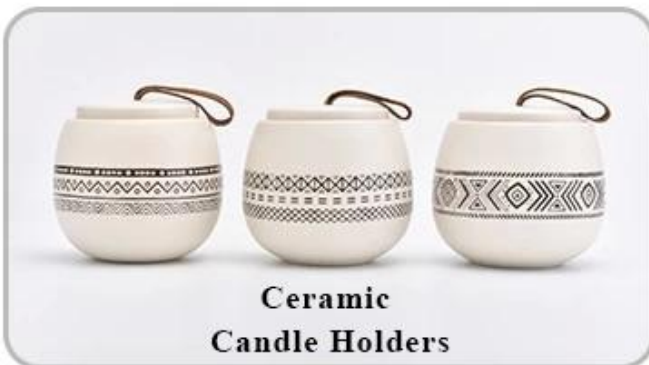
Ceramic Candle Holders