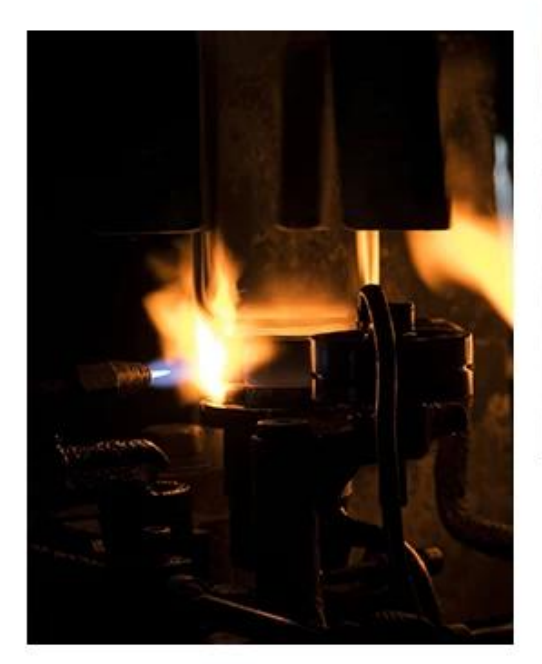
Superior quality and high efficiency can be guranteed.