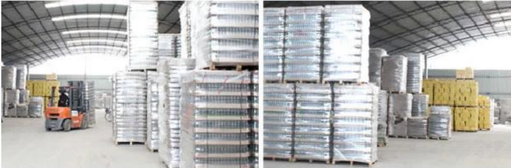
7. Storage Warehouse