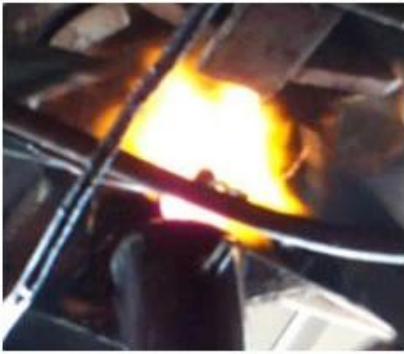
1. Material Cutting