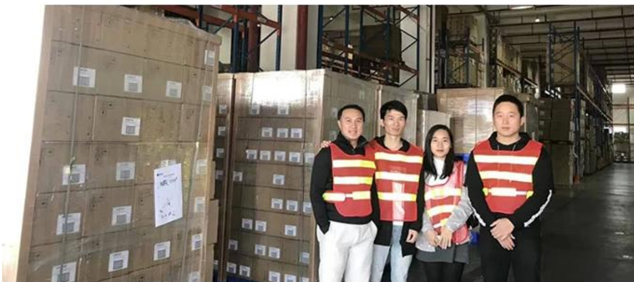
20+ years freight history and WCA members.