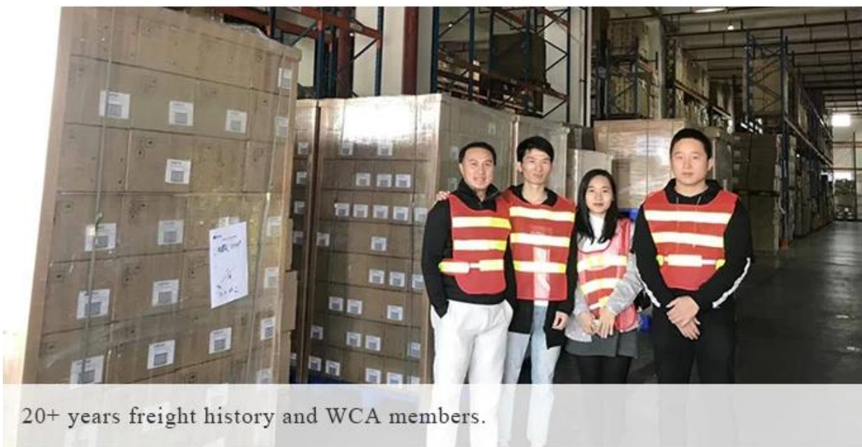
20+ years freight history and WCA members.