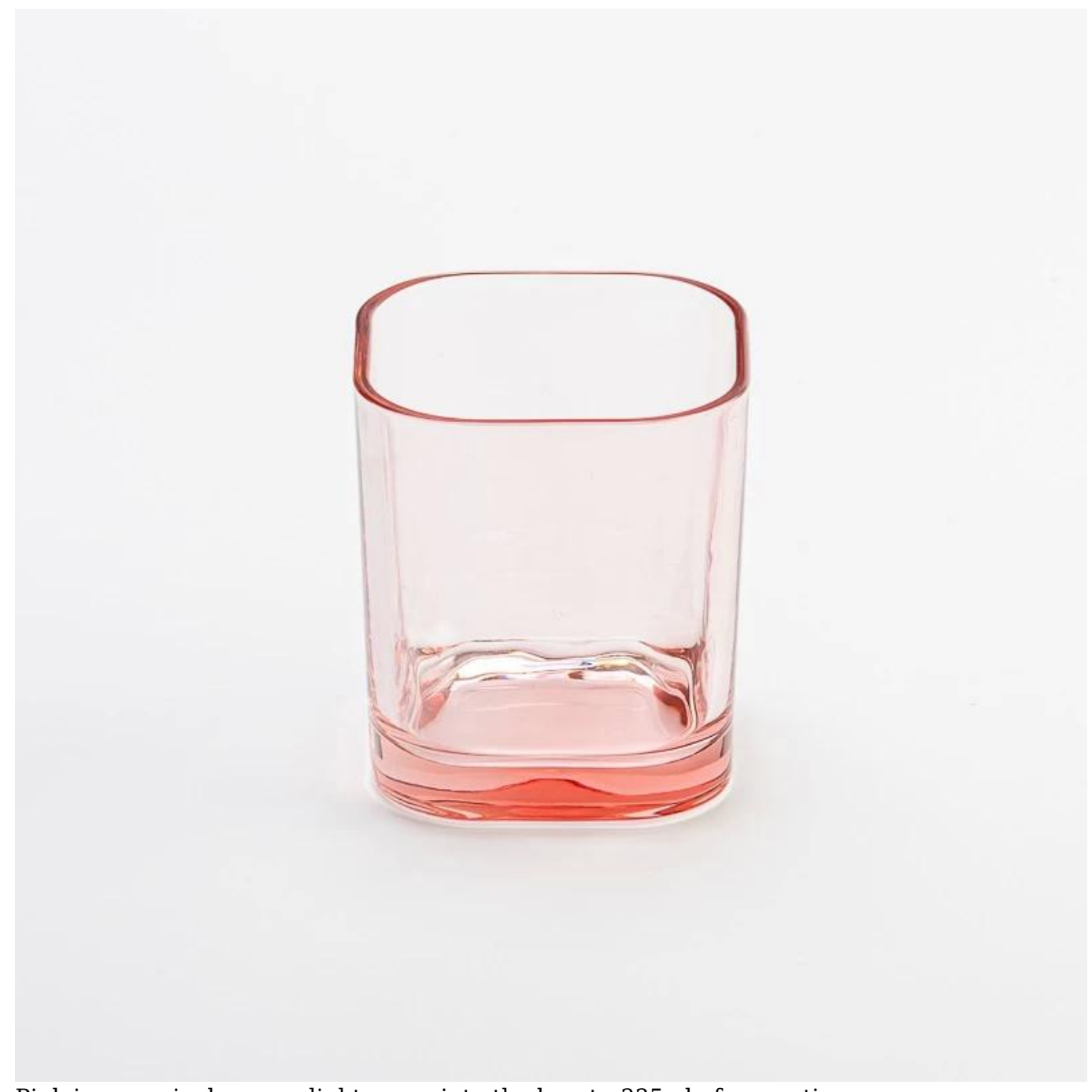
Pink in every inch, warm light seeps into the heart - 335ml of romantic ceremony