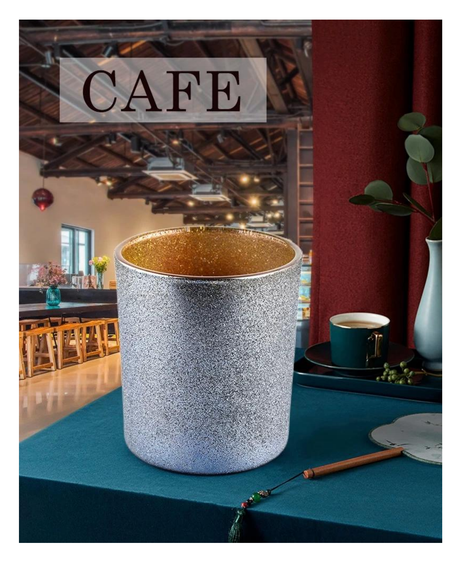
\underline{\underline{Sunny\ Glassware}}\ offers\ customized\ graphic\ design\ for\ glass\ jar\ decorations\ and\ molding\ service\ for\ glass\ jars\ and\ glass\ lids.