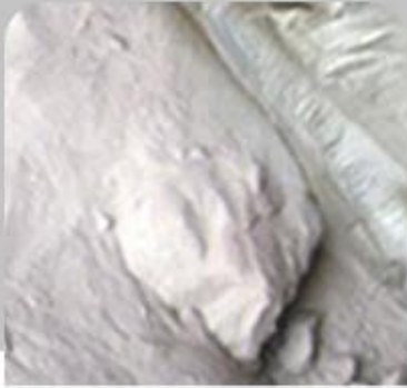
1、 Raw Material