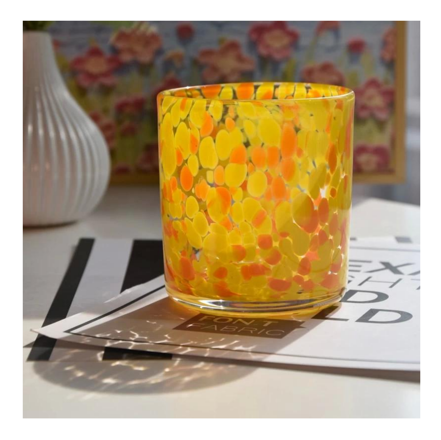
Wide range of application