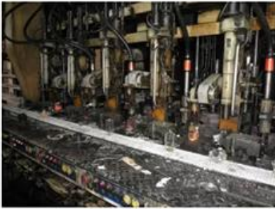
□ IS Machine