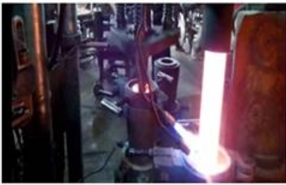
□ Machine Pressed