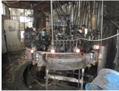
□ Machine Blown