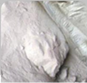
1、 Raw Material