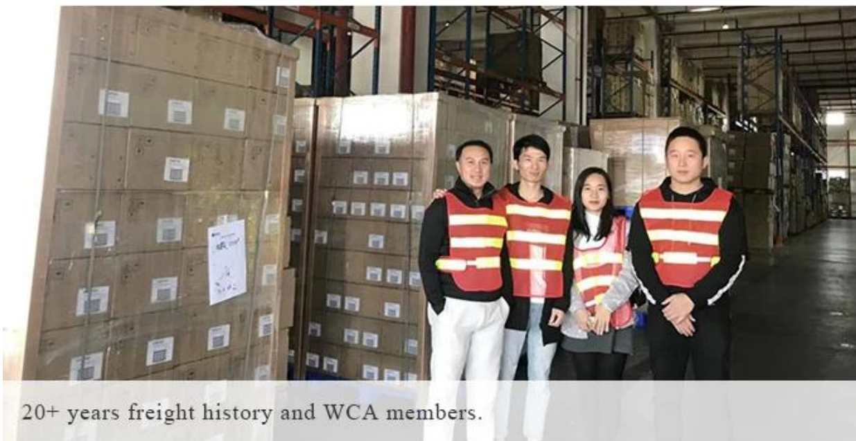
20+ years freight history and WCA members.